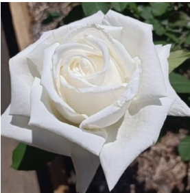
Rose of the week